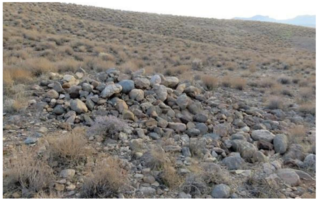
Fig. 9. Burial No. 9 of Cheshme Gandi