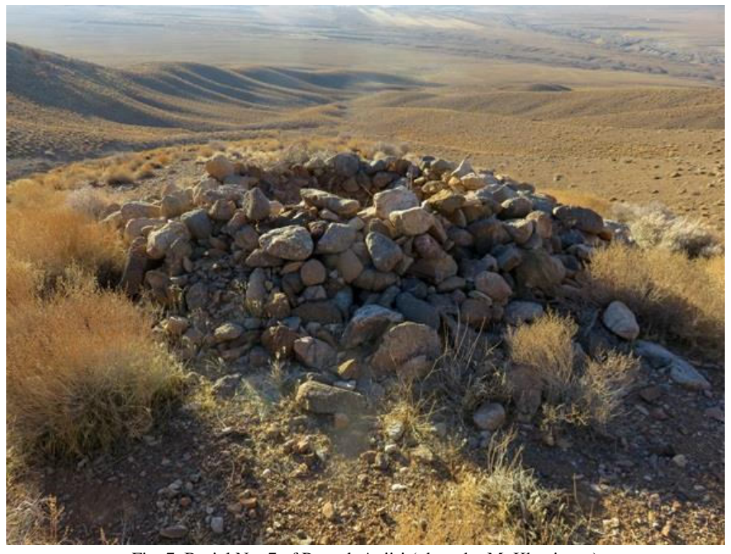
Fig. 7. Burial No. 7 of Pouzeh Anjiri