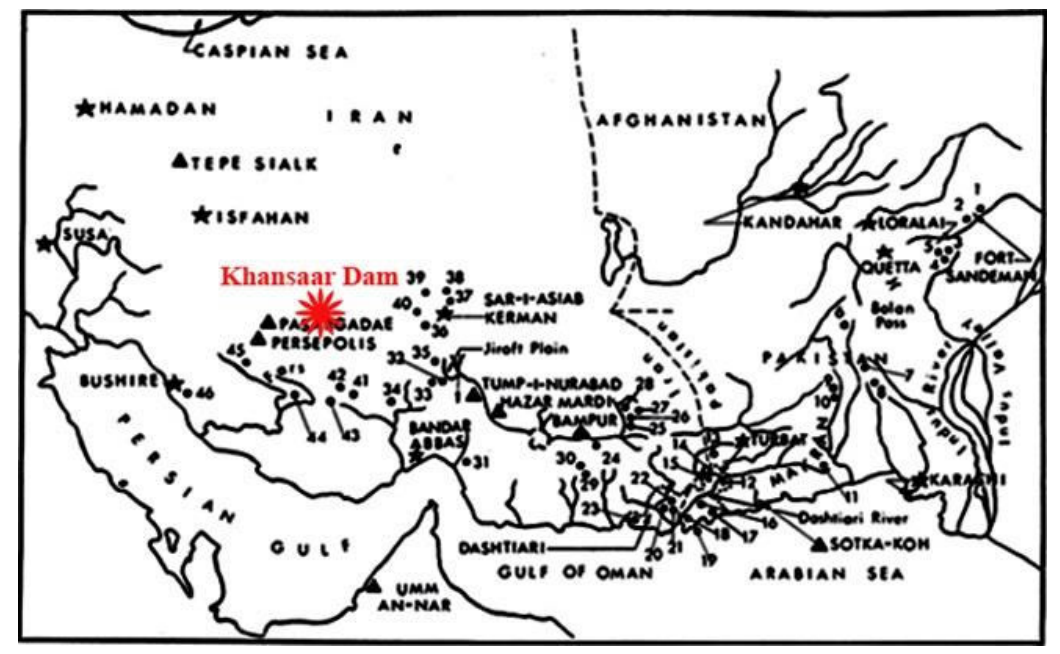
Fig. 2. Distribution map of cairn burials at south and southeast of Iranian plateau (after Lamberg-Karlovsky & Humphries, 1967)

In Fars province, this type of burial has been found in Darab and Fasa,<sup>21</sup> in Baghan and Kavar,<sup>22</sup> in Rahmat Mount,<sup>23</sup> Tange Bolaghi,<sup>24</sup> Firouzabad<sup>25</sup> and Bvanat<sup>26</sup> have been reported. A survey conducted in the vicinity of Khansaar Dam identified these graves in five areas [Fig. 3]. The local people of Fars refer to these types of graves as Khereftkhaneh, even though these graves are commonly referred to as Dambi and cairn burials. According to the people of Fars, during migrations in the past, these structures were built on top of mountaintops, and old people who could not migrate left with some food in them, so they could live for a time inside and then they died. Today, it is clear that these structures were constructed for burial purposes. As a part of this research, their local names are used, which will be discussed in the following section.