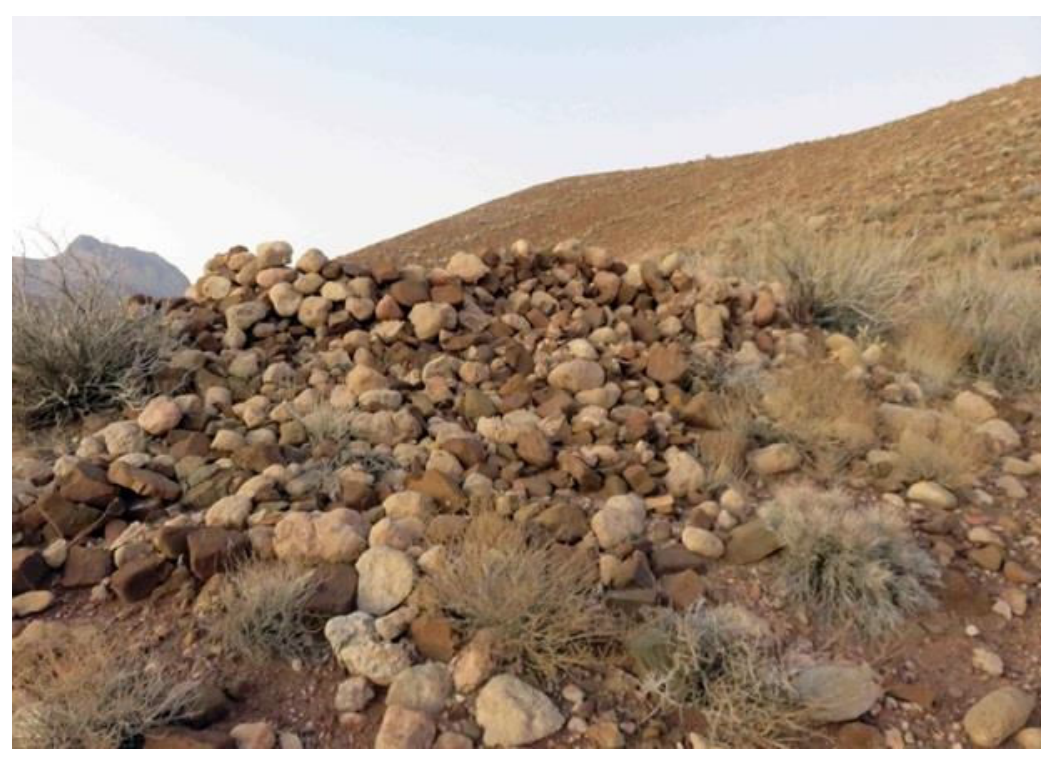
Fig. 4. Burial No. 12 of Maoor Qermez