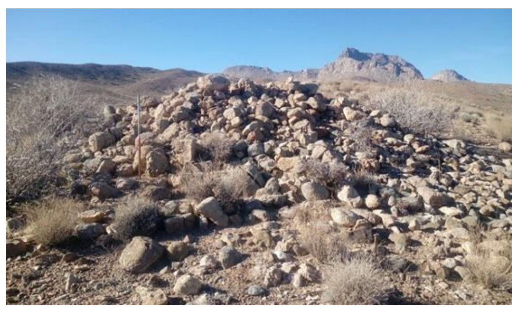
Fig. 5. Burial No. 7 of Pouzeh Zard