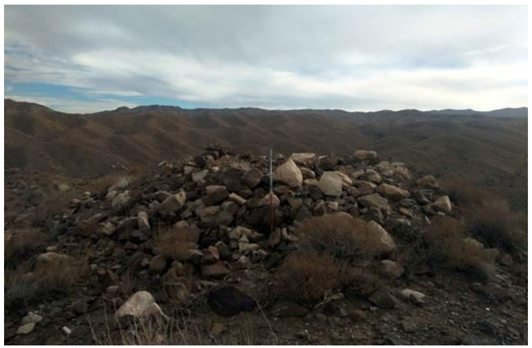
Fig. 6. Burial No. 10 of Pir Fazel