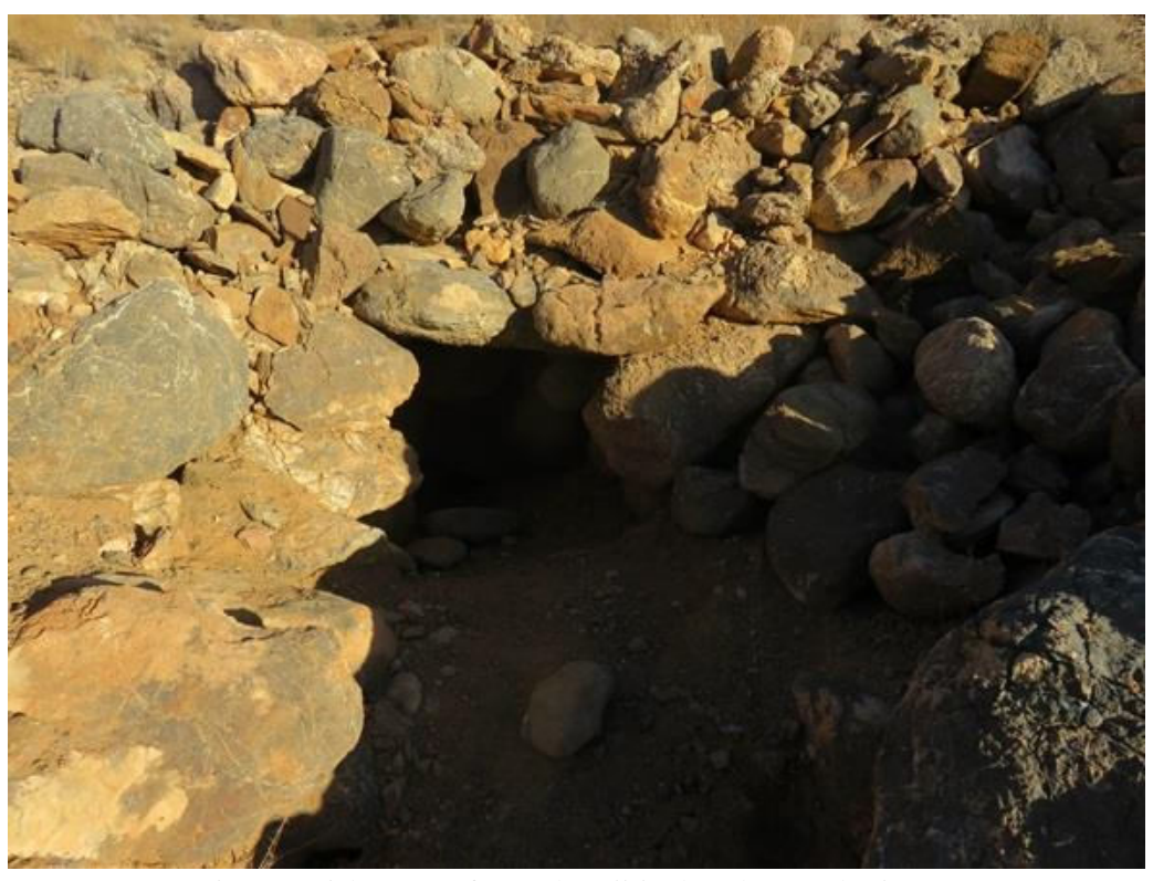
Fig. 8. Burial No. 11 of Pouzeh Anjiri