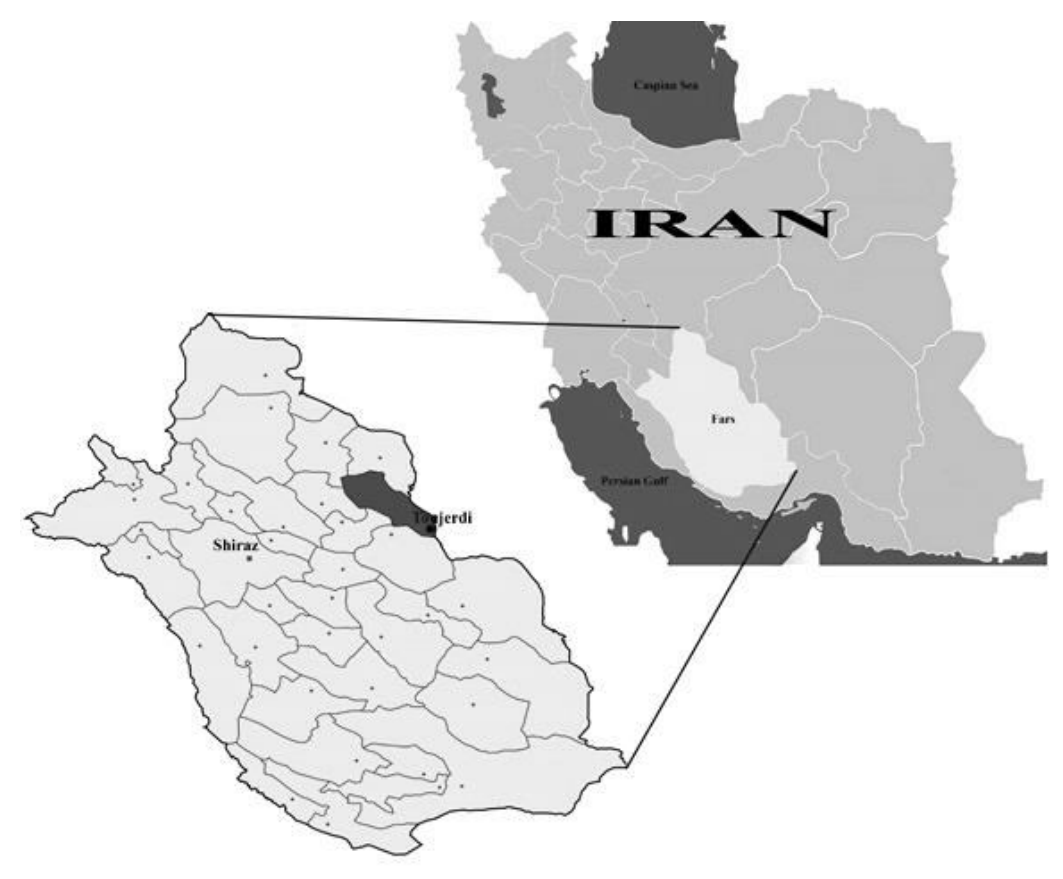
Fig. 1. Geographical location of Toujerdi